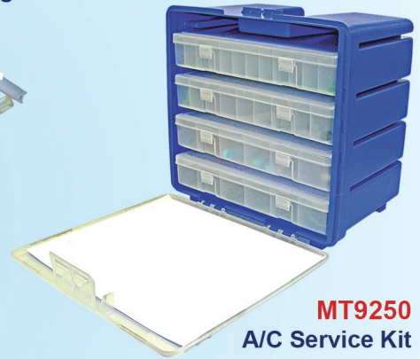
MT9250 A/C Service Kit