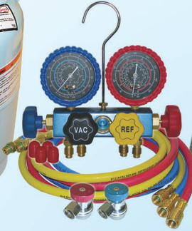
MT1480 4-Way Gauge Set