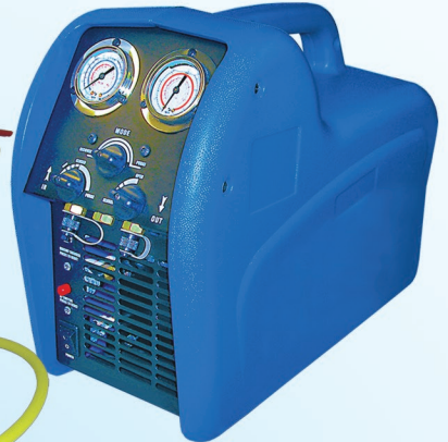
MT1725 (1/2 H.P.) MT1726 (1 H.P.) MT1732 (1/3 H.P.) Recovery Machines