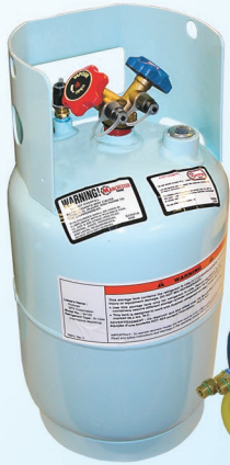
MT1729 R134a Refrigerant Recovery Tank

Engineered Replacement Parts™ For The Automotive A/C Industry