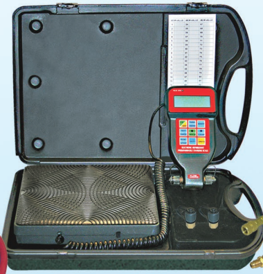
MT1720 Electronic Scale