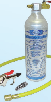
MT4054 A/C Flush Cylinder Kit