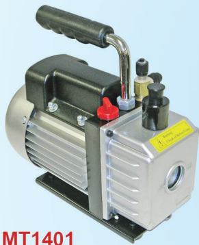
MT1401 Direct Drive Vacuum Pump