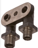
21-10198 Vertical @ 6:00 3/4 x 7/8 Oring