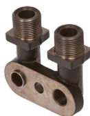
Vertical 1" x 14 Tube-O 21-10137