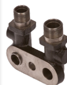
21-10133 Vertical 3/4 x 7/8 Oring