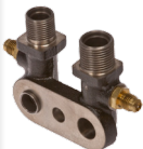
21-10139 Vertical 3/4 x 7/8 Oring w/R12 Ports